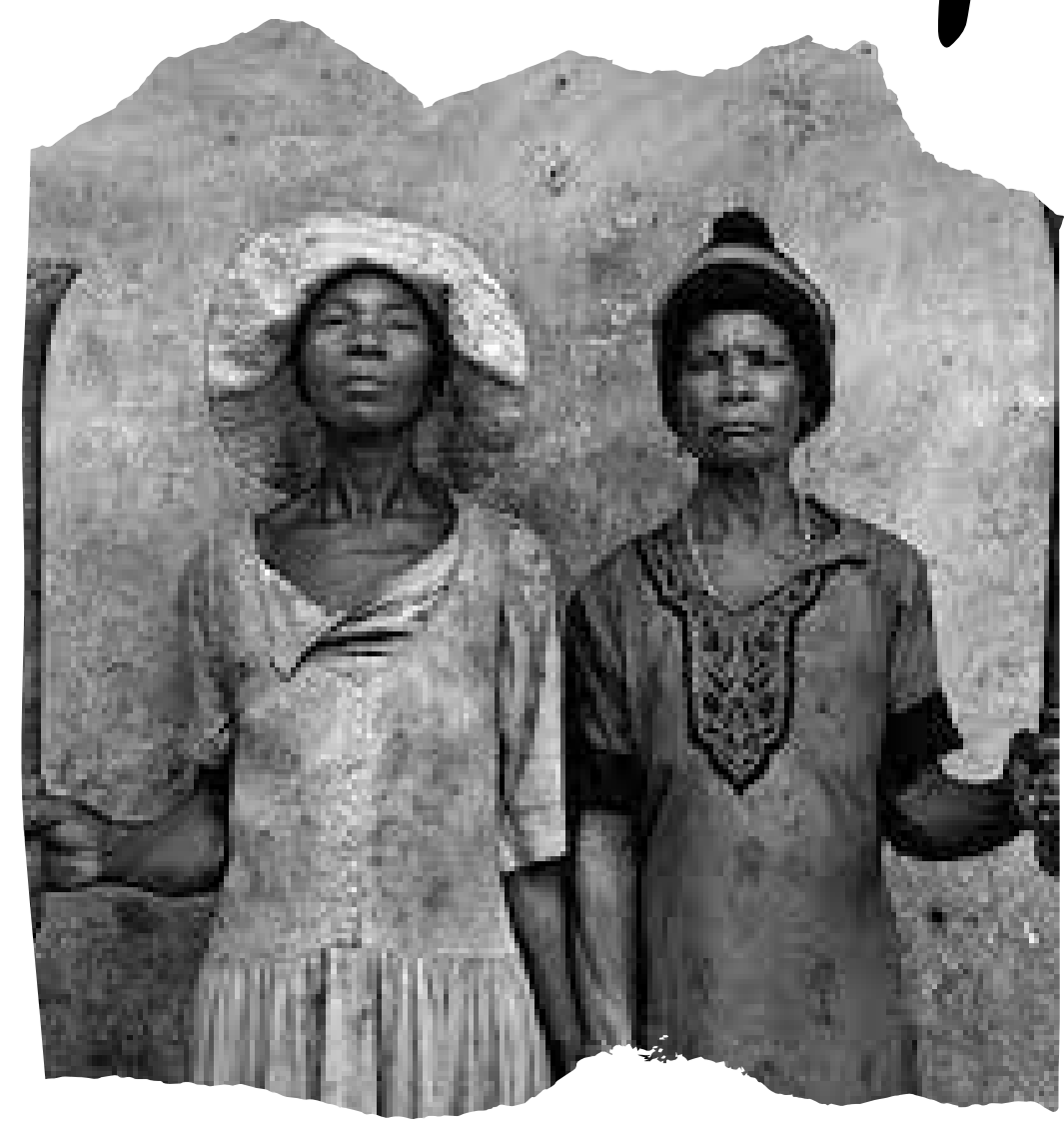
uprising of slaves in the 17th century in Jamaica